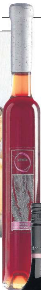
Classic: Show Reserve Liqueur Verdelho.

The Show Reserve is a nice blend of older material with some youthful freshness.