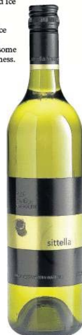
Lemon scented: The 2007 semillon is a beauty.